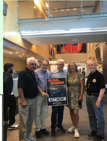
Rotarians with Mayor and supporters holding "Global Warming ACT NOW" sign

The annual Craft Beer Festival at Richmond Hill Centre for the Performing Arts was a tremendous success, with guests enjoying craft beer tasting, food, and entertainment. Funds raised support environmental projects and community programs, demonstrating the community's strong support for Rotary's mission of service.