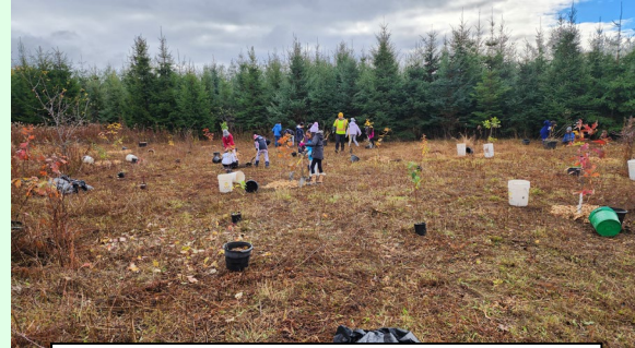
Students actively planting across the Oak Ridges Moraine site

The event began at 9:30 AM with demonstrations from UFA staff on how to plant trees and shrubs and observe safety rules. Students worked enthusiastically, planting trees in teams and learning hands-on environmental stewardship.